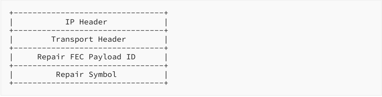
Figure 7: Structure of an FEC Repair Packet with the Repair FEC Payload ID

More precisely, the Repair FEC Payload ID is composed of the following fields where all integer fields are carried in "big-endian" or "network order" format, that is, most significant byte first (Figure 8):